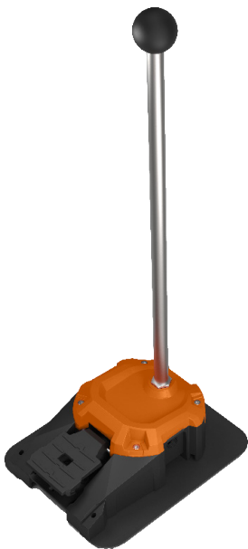
with 6050-5500-0154 Base Plate (order details see "Accessories")