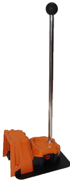
with 6050-5500-0154 Base Plate and Guard (order details see "Accessories")